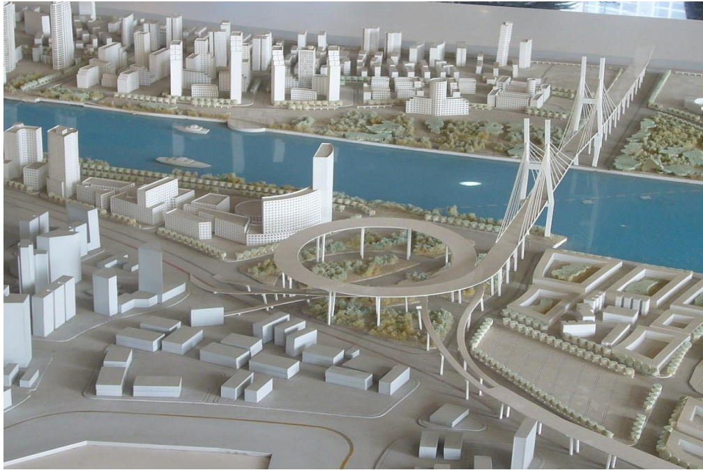
3-picture. (The modern look of the Bandikhan)

looking at the urban centers in terms of their pattern of growth, development and evolving strategies which make them more productive, smart, efficient, healthy and sustainable.