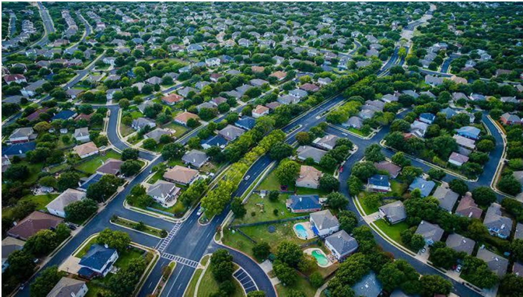
4-picture. (The modern look of the Bandikhan)