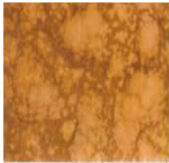
Figure 2: Optical macrograph of metal side of manganate coated specimen after adhesion test.

The failure path demonstrated by the manganate/lacquer which is mostly cohesive in the lacquer indicates that after protracted exposure in the humidity cabinet, the forces within the lacquer weakened such that for the most part the adhesion between the lacquer and the manganate coating was superior.