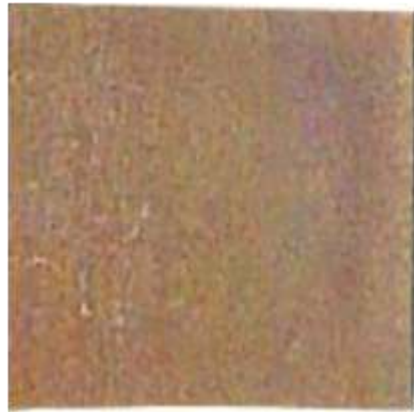
Fig. 1 Optical macrograph of aluminium specimen treated for 3mins in manganate conversion coating solution at 30°C.

As displayed in Fig. 1, which is the surface of aluminium specimen treated for, 3 minutes in the manganate conversion coating solution, the coating is comprised of light and dark coating materials which developed over the initially lustrous, shiny finish of etched and desmuted aluminium substrate. These two shades are related to the colour of the coating which is a mixture of green, purple and brown as observed under the optical microscope at magnification of about 700 times. The coating has developed over inclusions and pits that may have been present in the metal.