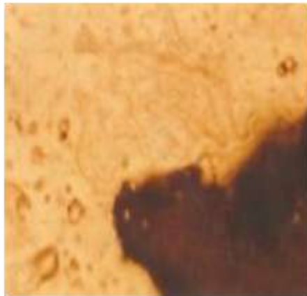
Figure 4: Optical micrograph of metal side of 'bare' aluminium after adhesion test

From Figs. 2 and 3, which are macrographs of the metal and tape sides for the manganate specimen after adhesion test, it can be observed that on the metal side, there are tufts of resin, whereas the left over resin on the tape side showed depression replica of the metal side. This confirms that the failure path was cohesive in the lacquer. The failure path for the 'bare' lacquer coated aluminium was adhesive and it occurred mostly at the lacquer/aluminium interface which indicates that the air-formed film on the aluminium substrate is a poor surface to receive paints. From Fig. 4, it can be observed that the metal surface, displayed at the top left hand side of the macrograph revealed only incipient pits developed during interaction with the hot humid environment in the cabinet. However an occasional let over resin, which appears darker than the rest of the surface is displayed at the bottom right hand corner of the figure.